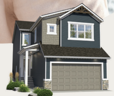
Front Garage Homes